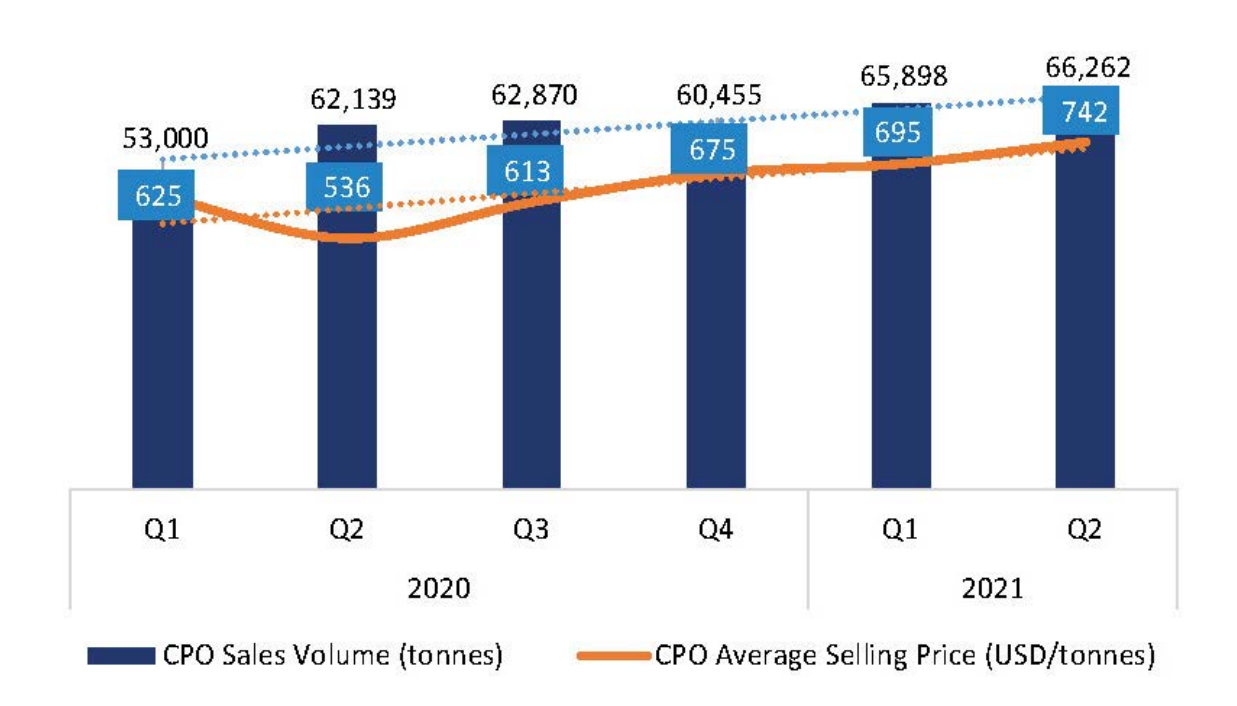
Graph 1: CPO Sales Volume and Average Sales Price by Quarter